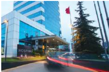
Healthcare & Life Sciences