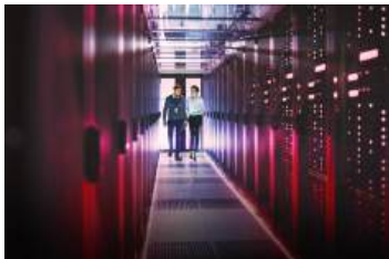
Technology & Data Centers